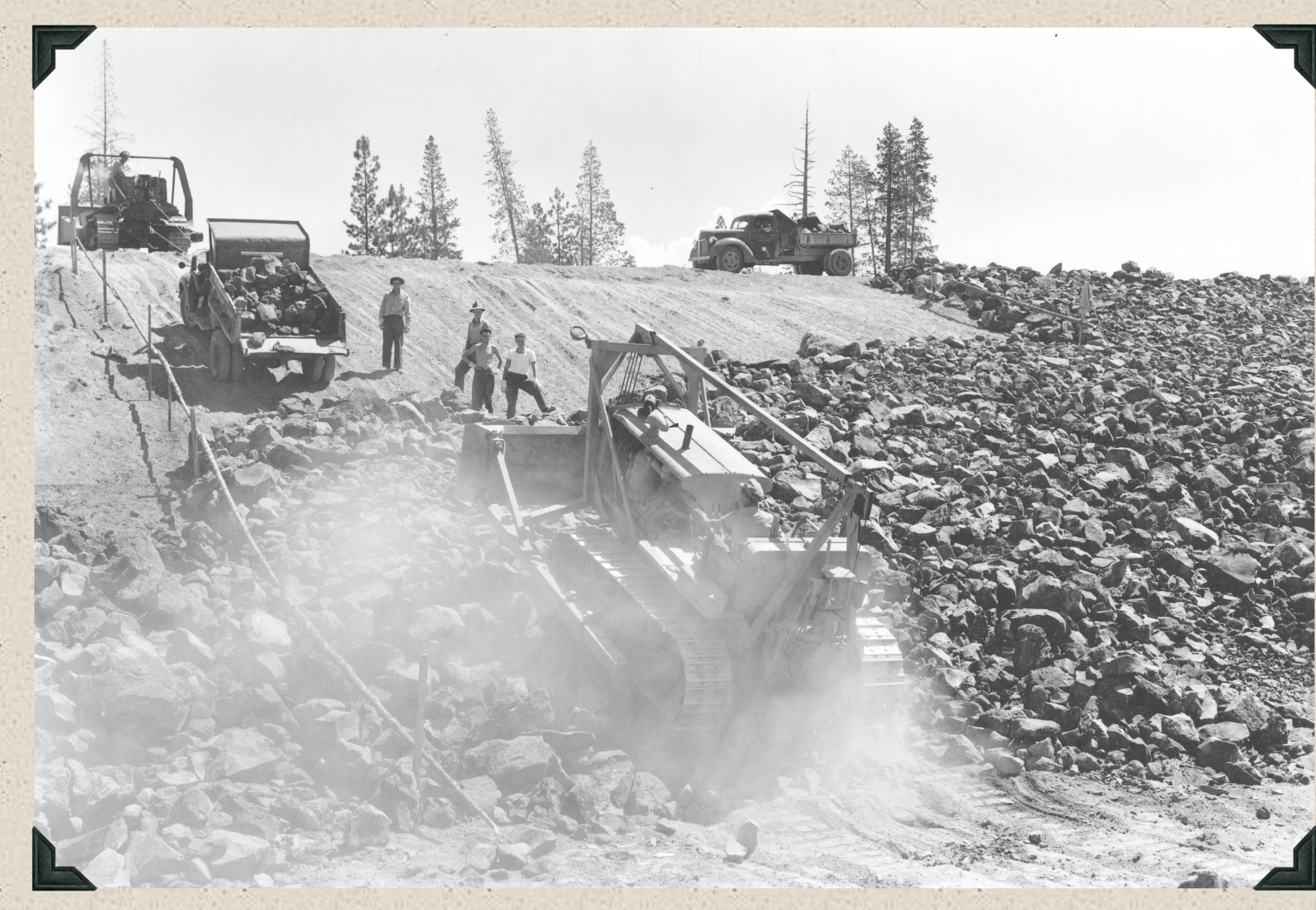
1944 - Wickiup Dam. Civilian Public Service (CPS) assignees placing riprap on upstream face. Dozer shaping toe of riprap.