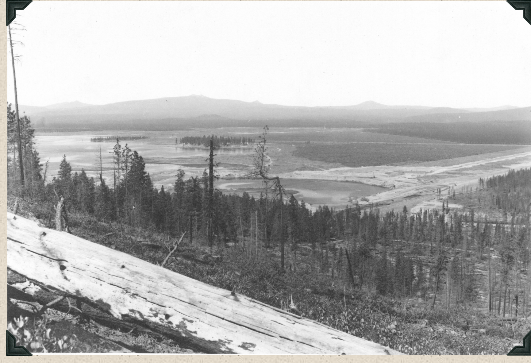
1943 - Wickiup Reservoir from Wickiup Butte. Storing 9,000 acre feet. Camp Wickiup near center in group of trees.