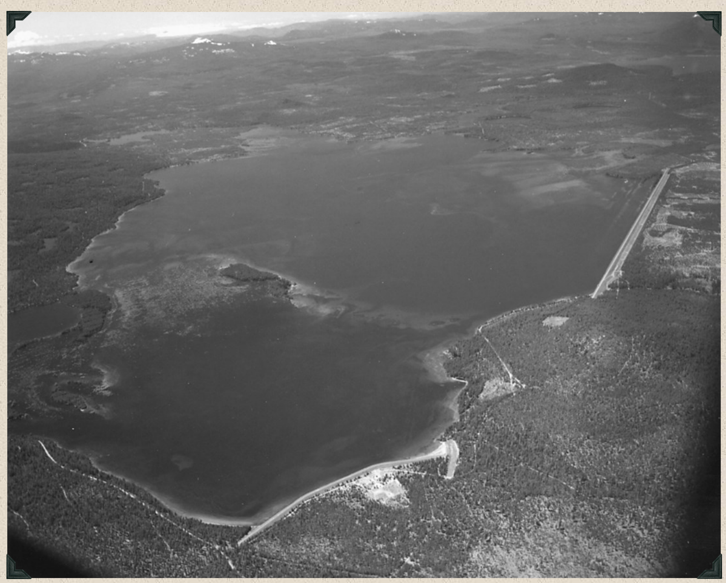
Aerial view - Wickiup Dam and Reservoir