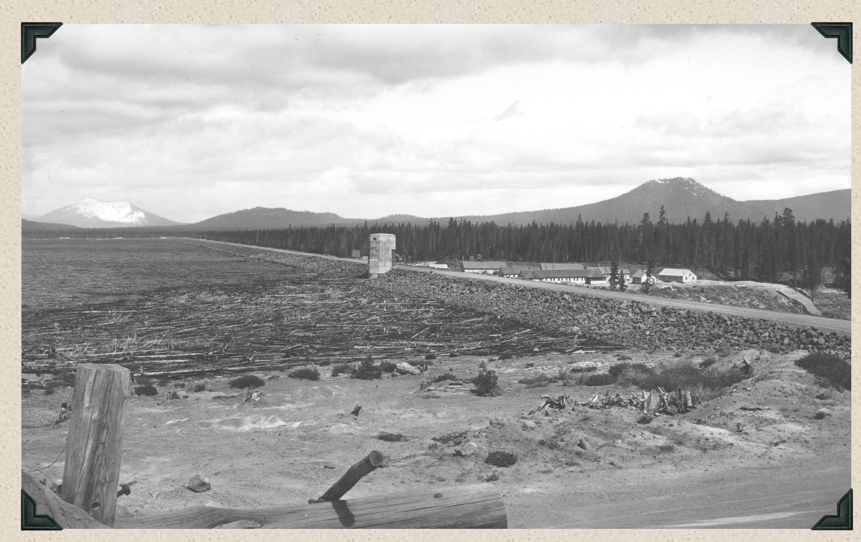
1950 - Wickiup Dam. Looking north from right abutment, Bureau maintenance buildings located below the dam with Round Mountain beyond. Snow covered Cultus Mountain to the left. Reservoir at near maximum storage. (Maximum storage capacity 200,000 acre feet)