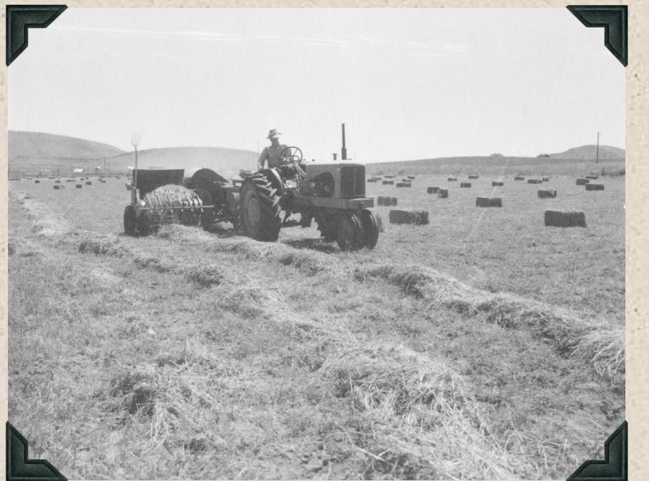
1951 - Cutting and baling alfalfa hay on the Spencer farm near Madras, Oregon.