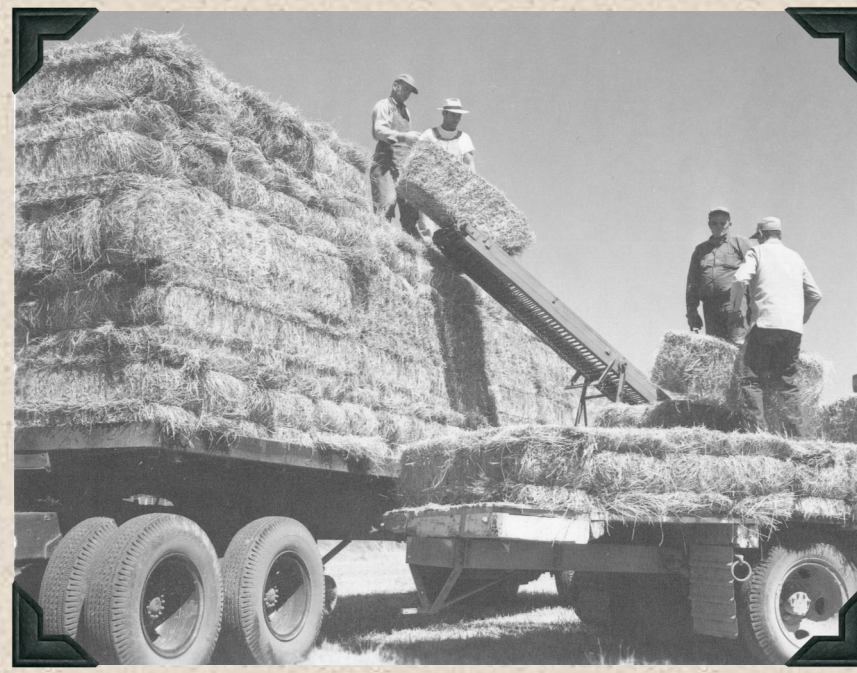
1951 - Loading alfalfa hay at the Roy Buck farm near Culver, Oregon.