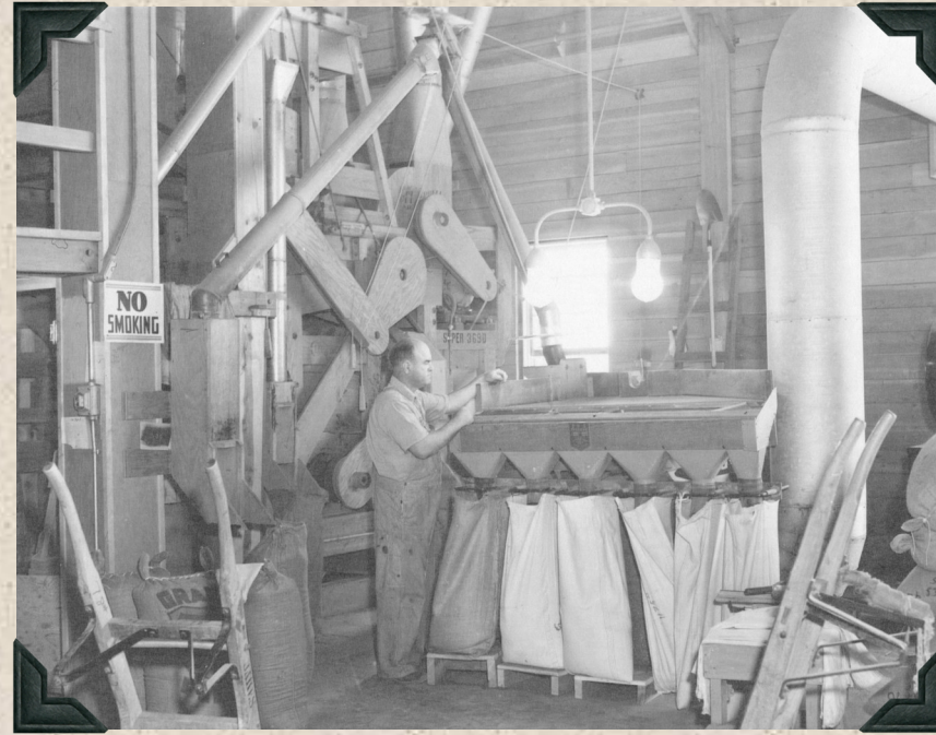
1951 - One of several clover screening tables in operation at the Pacific Supply Cooperative. Madras, Oregon.