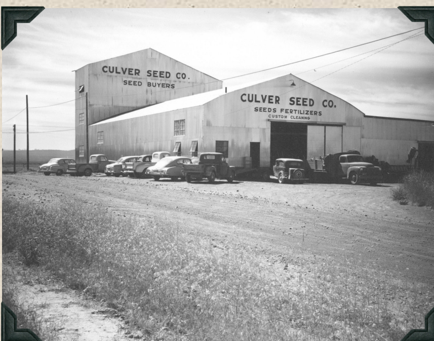
1952 - Seed processing company in Culver, Oregon. The seed business, a major income for the project, is reflected by large investments of seed companies in Culver and Madras.