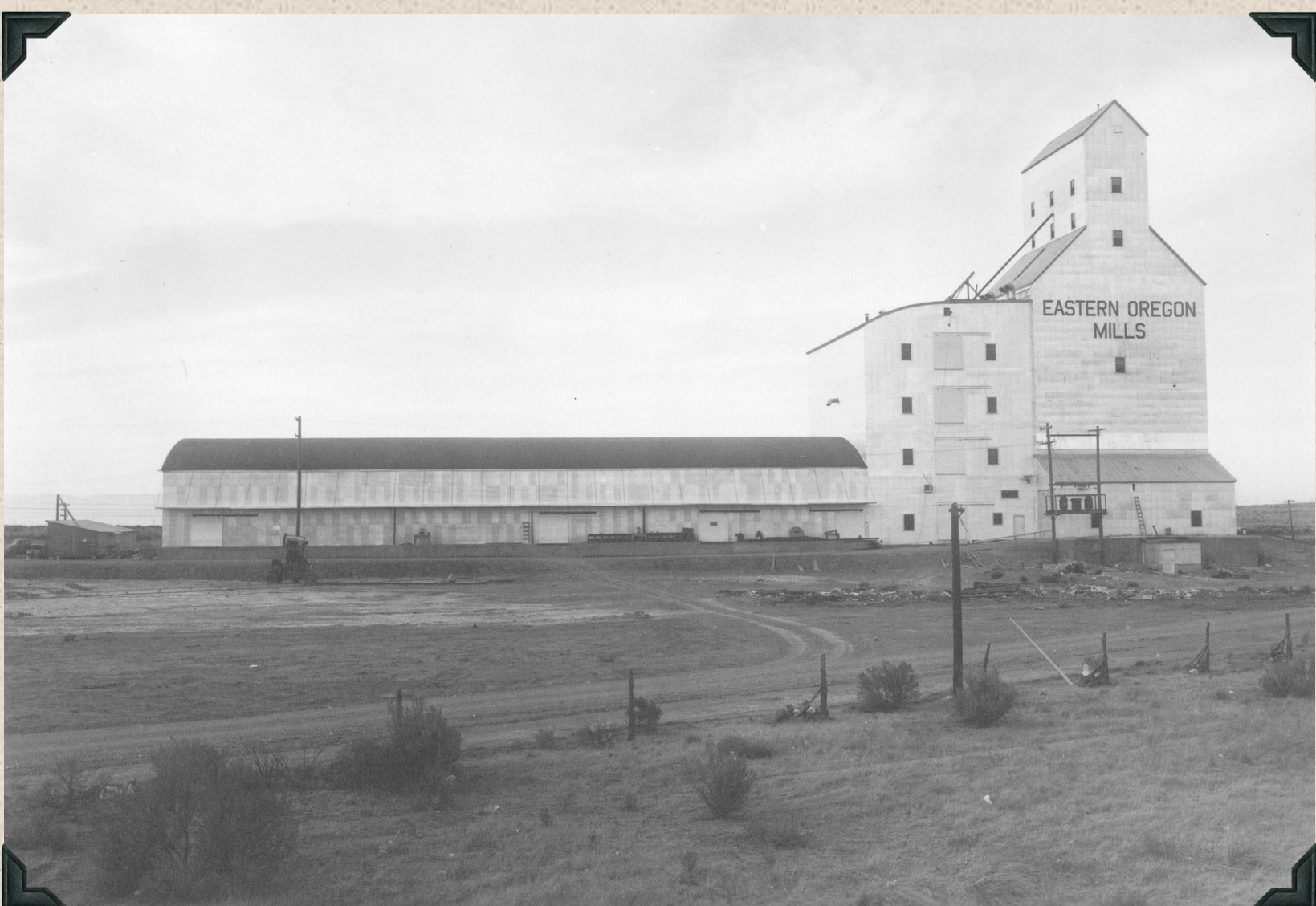
1949 - Industrial development. New elevator and seed warehouse, Madras, Oregon.