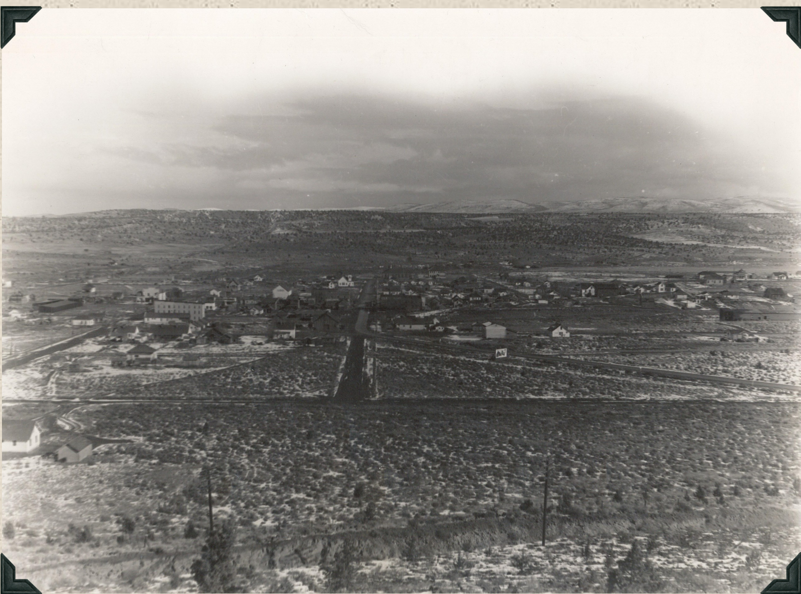
1944 - Madras, Oregon located in the heart of the North Unit project lands. Deschutes Project, Oregon.