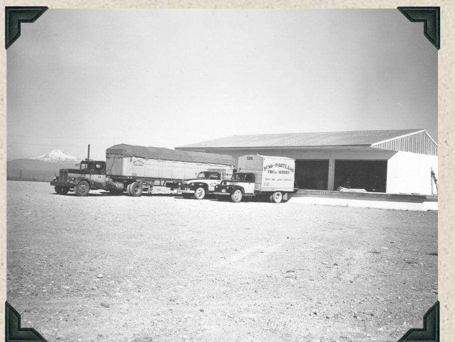
1952 - New truck warehouse in Madras, Oregon. This company operates throughout Oregon giving pickup and delivery service at the Project farmers door to Portland and other distant markets.