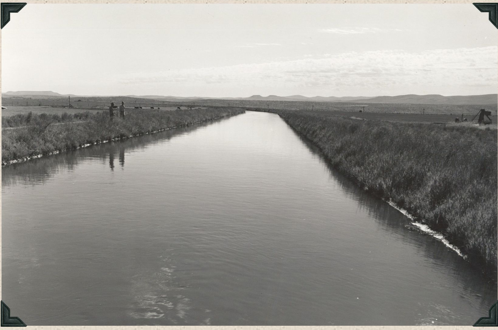
1952 - North Unit Main Canal at Mile 55, showing stand of Crested wheat and Brome grass seeded on canal banks to prevent weed infestations.