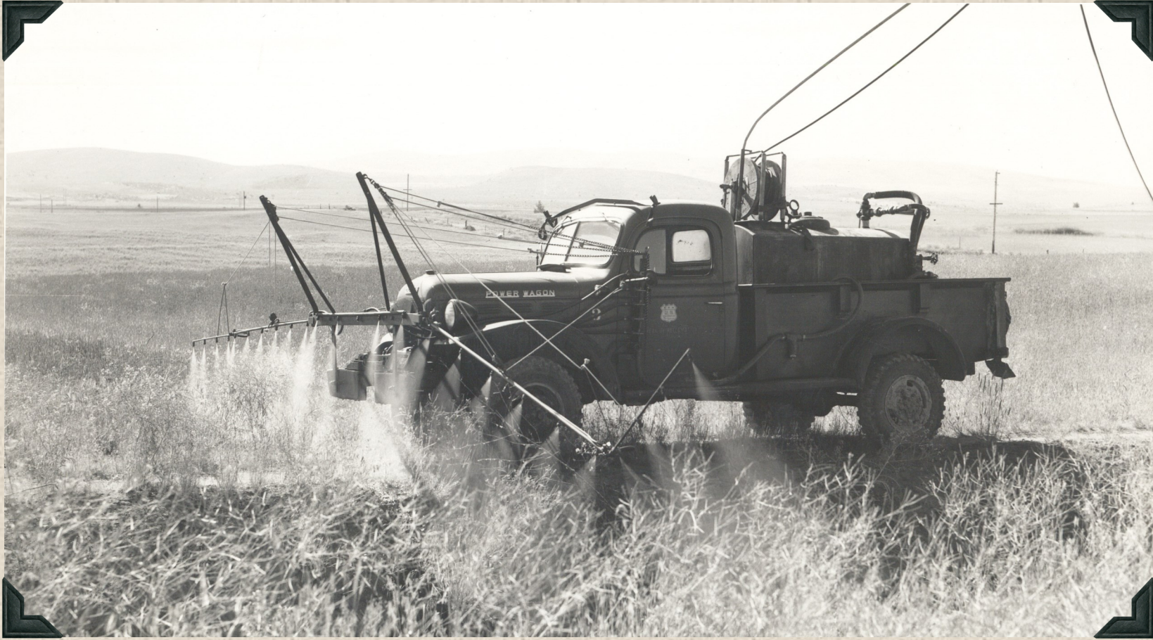
1951 - This weed sprayer was constructed by the O & M personnel in the Madras Shop. The spray booms are readily raised and lowered by the truck driver as variations in contour require. The driver also has complete control of the spray solution to the various sections of the spray boom while the truck is in motion.