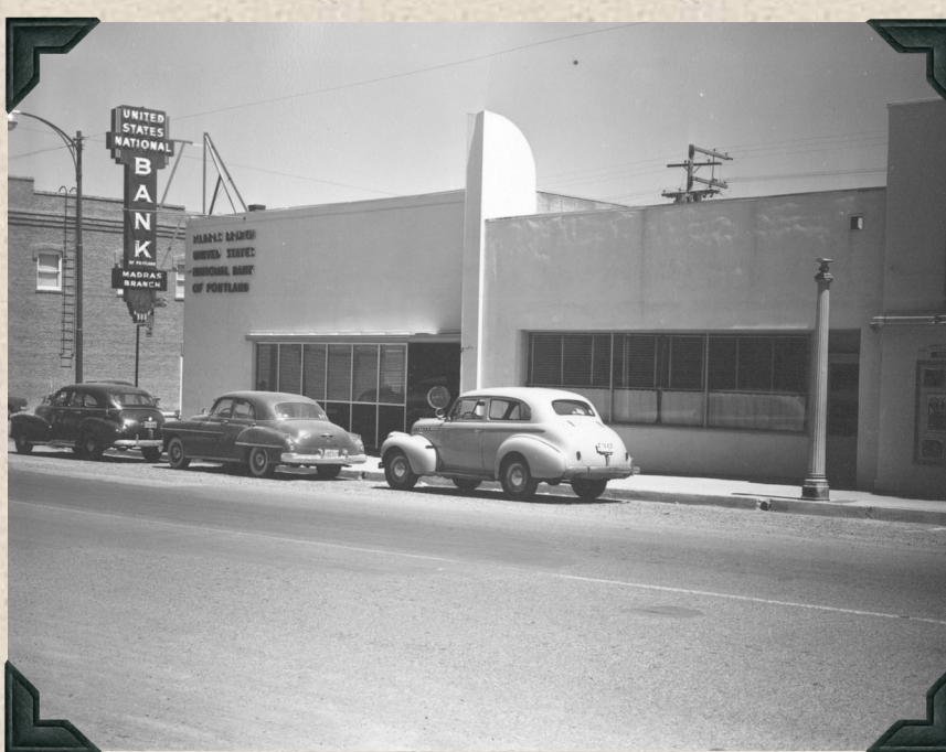
1952 - New bank building in Madras, Oregon, definitely indicating the growing trend of this project center trading area.