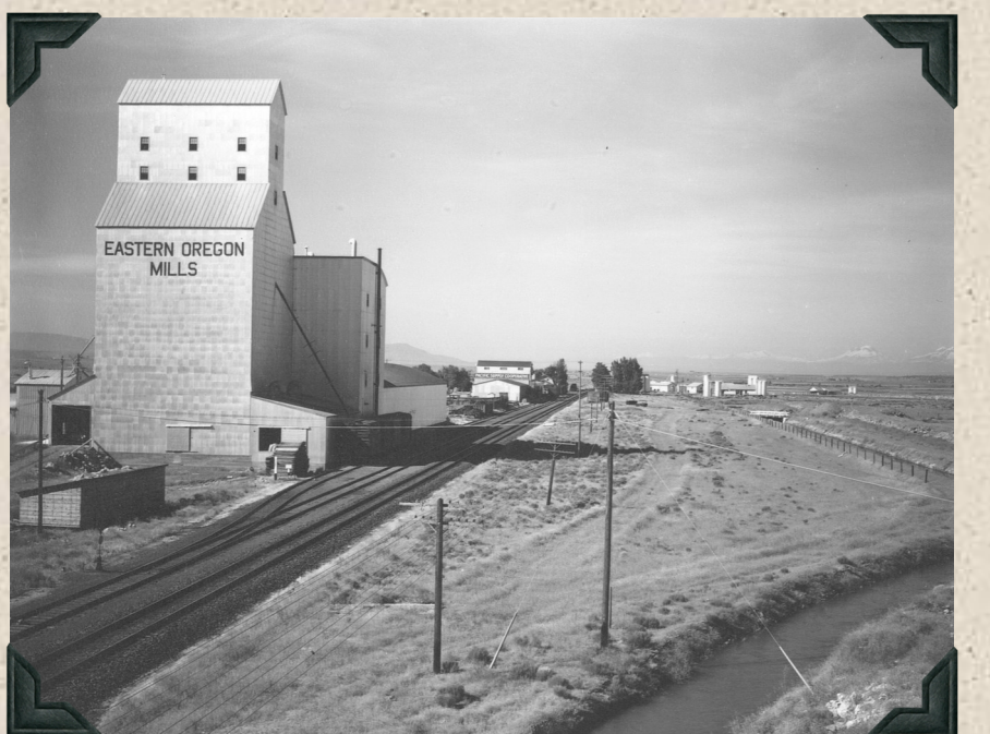
1952 - Wholesale and commercial plants located in Madras, Oregon on the Union Pacific Railroad right-of-way.