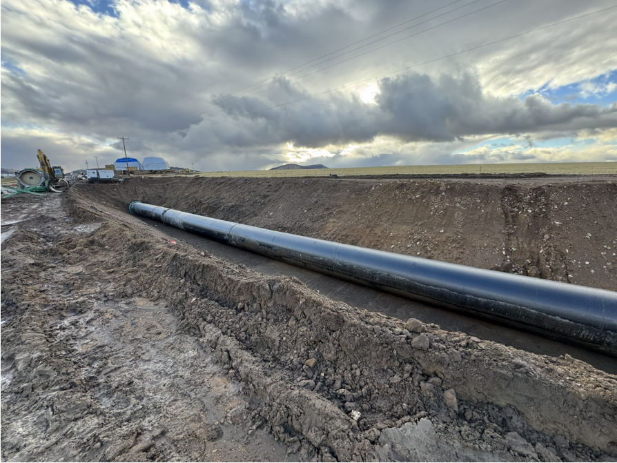
43 - INSTALL 63" STARTING AT FLANGE ADAPTER