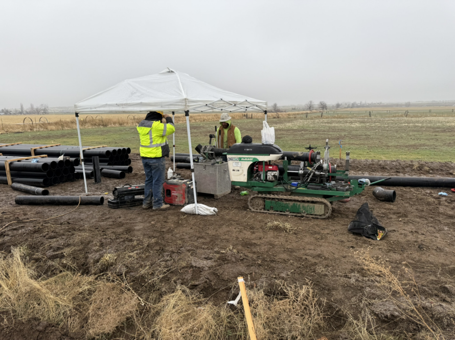
43-2 ASSEMBLING TURN OUTS