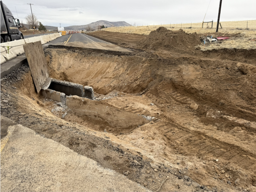
REMOVING BOX CULVERT WEST SIDE OF HWY 97