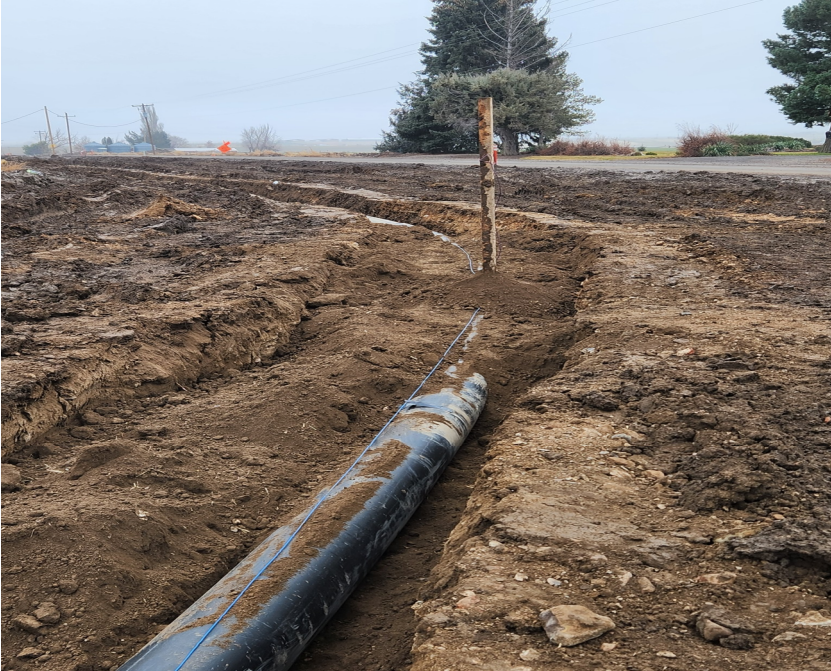
43-2 16" INSTALL