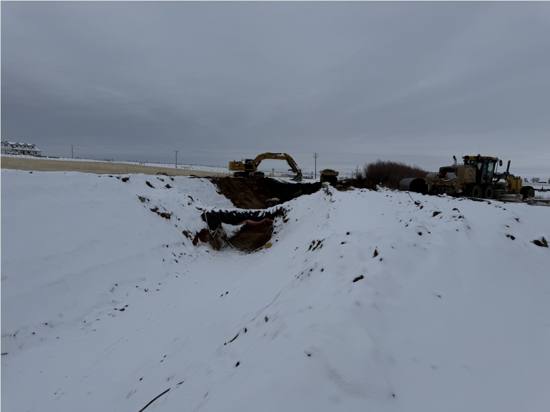
43 EXCAVATE WEST OF 97