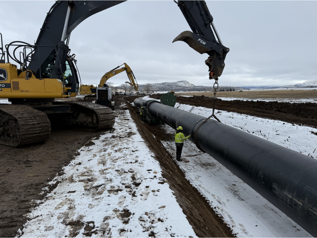
43 LATERAL WELD 63"