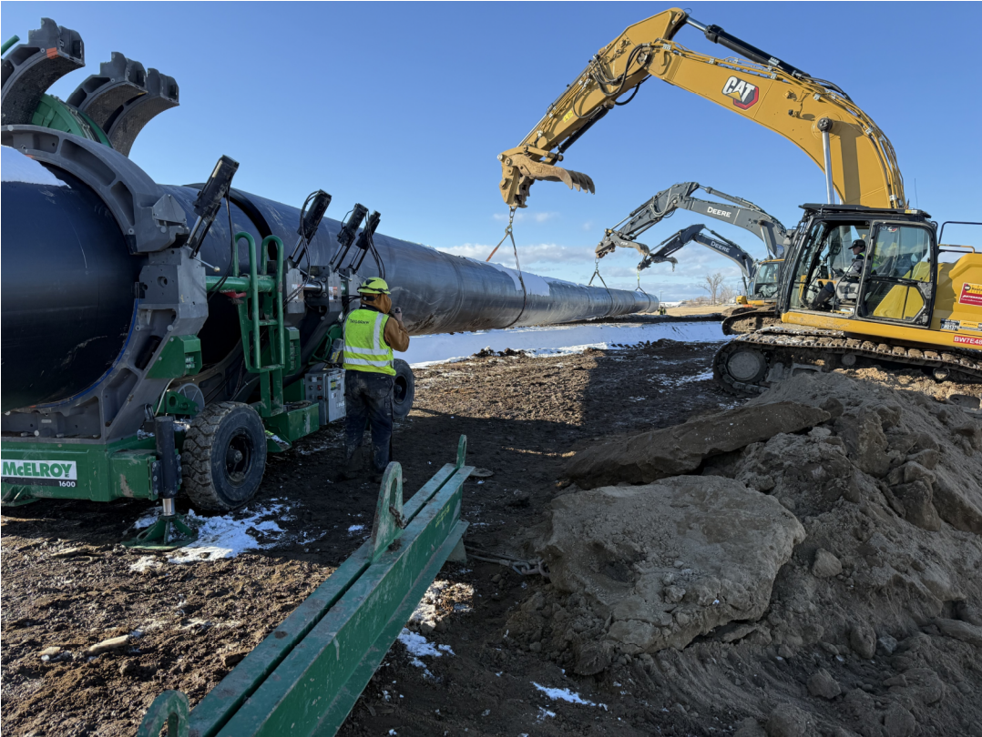
43 LATERAL WELD 63"