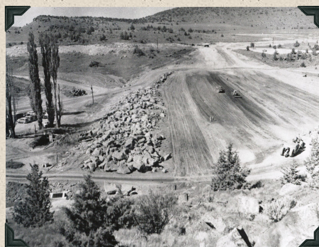
1957 - Placing earth and rockfill in dam embankment in zones 1, 2 and 4.