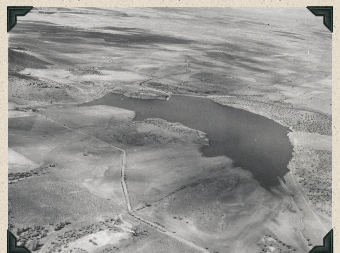
1958 - Aerial view of Haystack Reservoir from the southeast. County road left foreground.