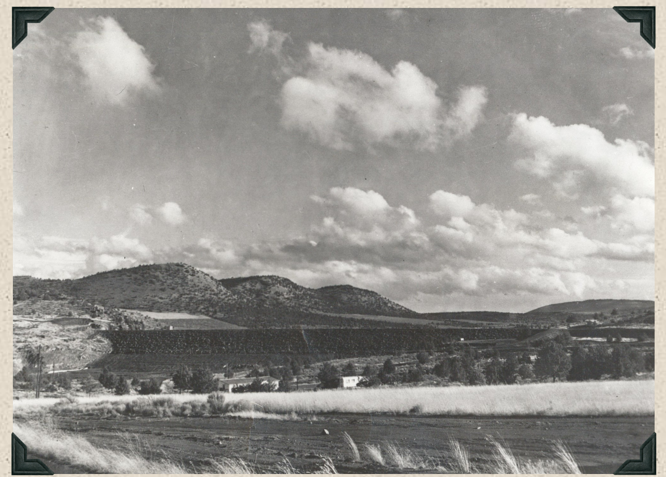
1957 - Haystack Dam.

Location: Offstream about 10 miles south of Madras, OR