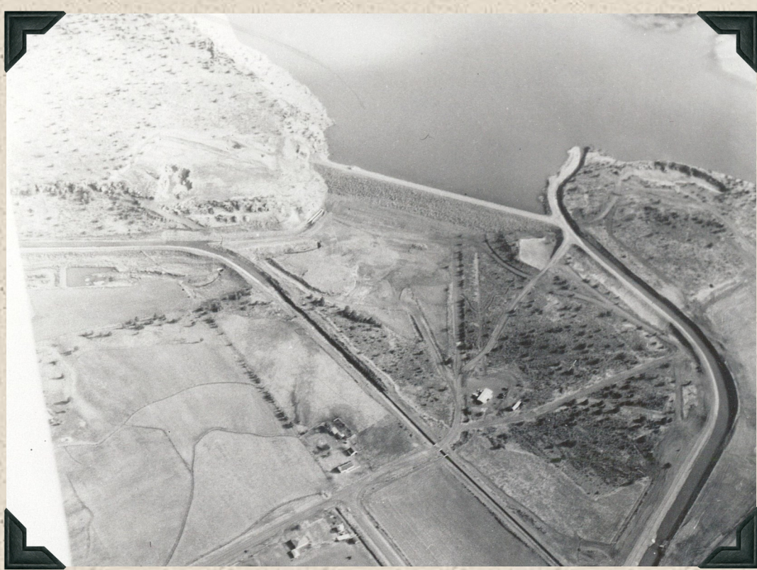
1958 - Aerial view of Haystack Dam. Feeder canal on the right and North Unit Main Canal in the center and to the left along the base of the right abutment.