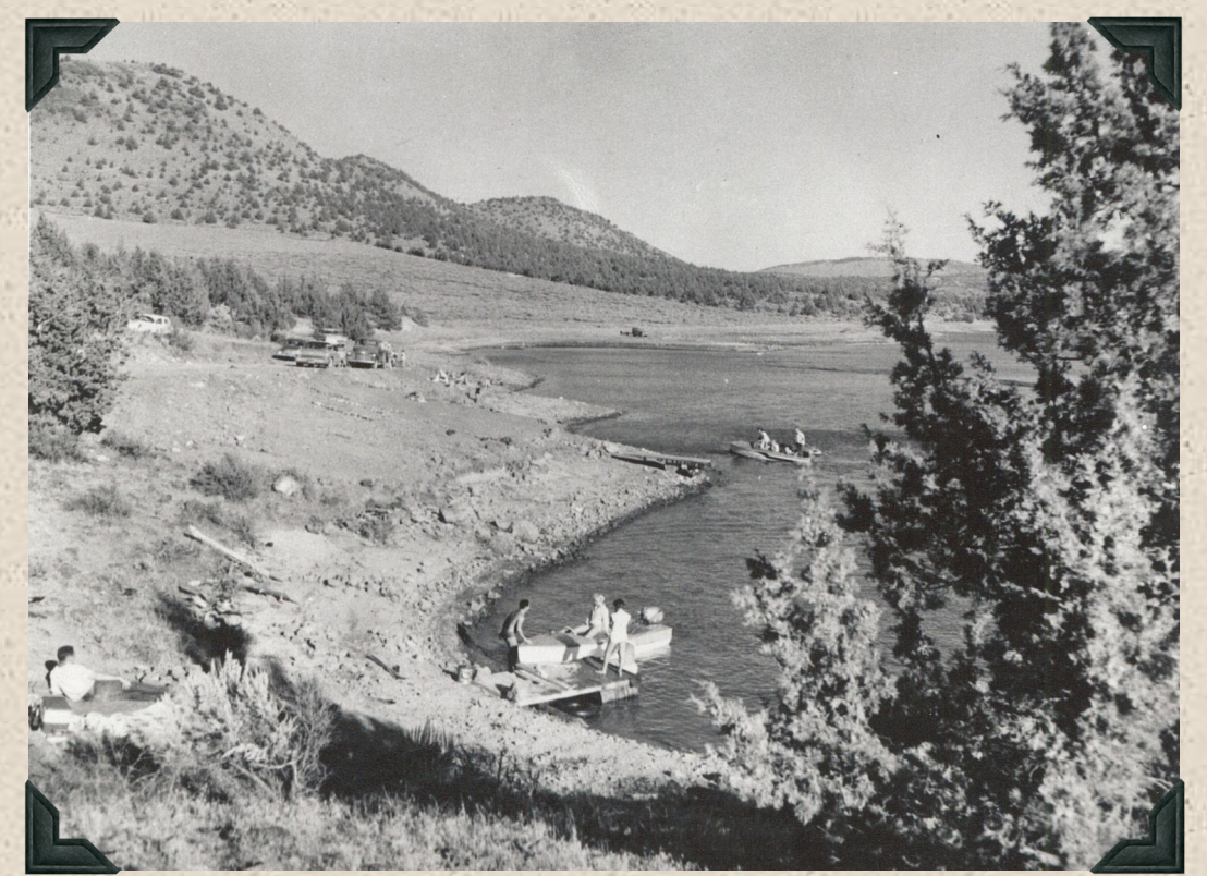
1958 - Recreation. Swimming, boating and picnicking on the shores of Haystack Reservoir.