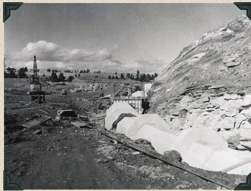
1957 - Completed upstream section of concrete outlet-works conduit and cut-off collars.