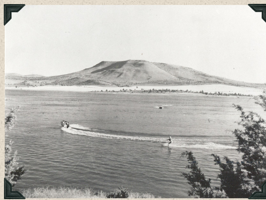
1958 - Recreation. Water skiing on Haystack Reservoir. Haystack Butte in the distance.