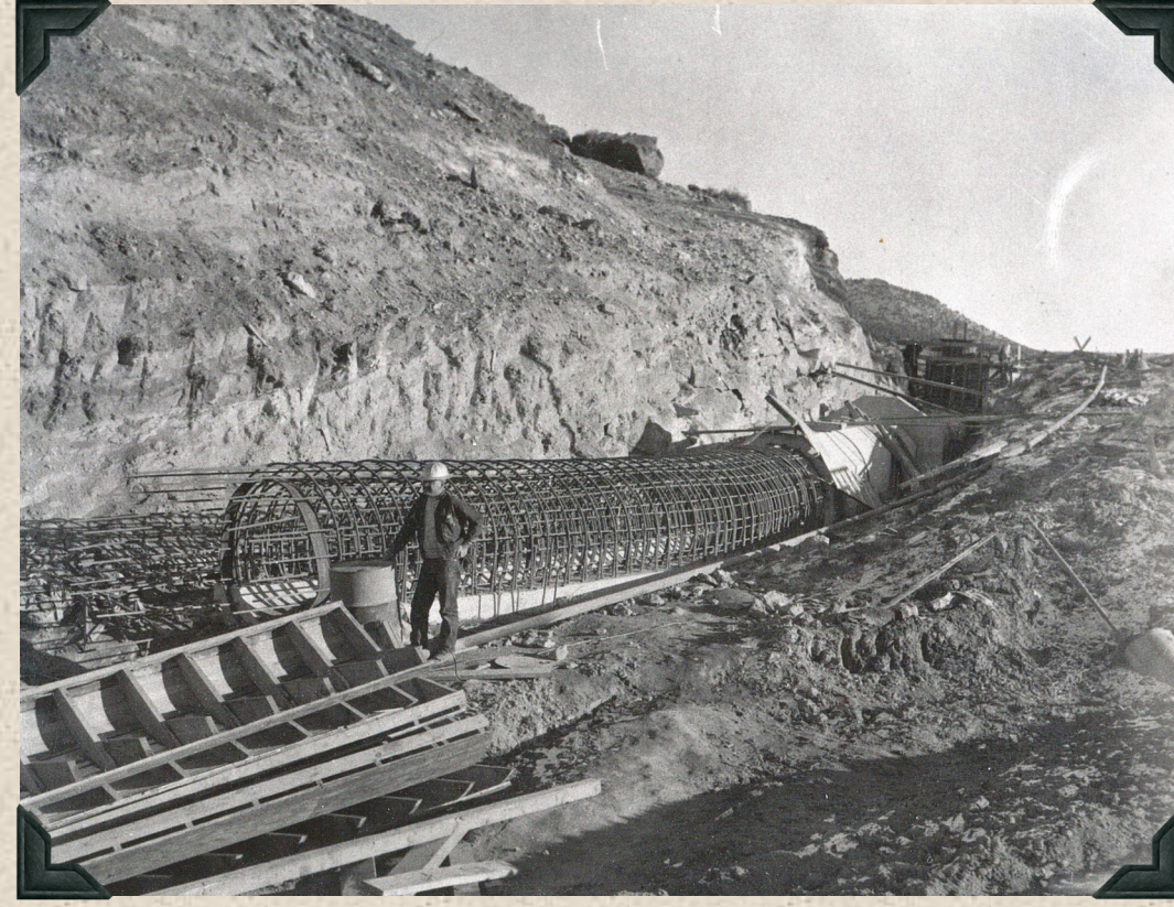
1956 - Reinforcement steel in upstream section of outlet-works conduit.