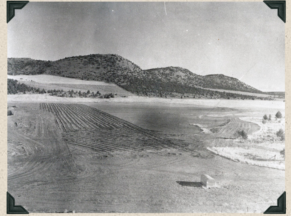
1956 - Borrow area #1 in Haystack Reservoir site.