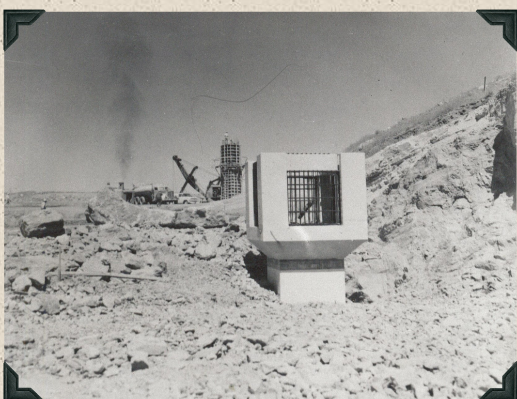
1956 - Intake structure of outlet works.