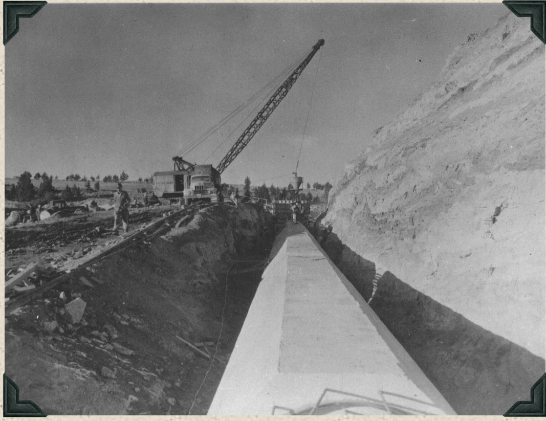
1956 - Outlet-works upstream conduit concrete in place prior to placing cut-off collars.