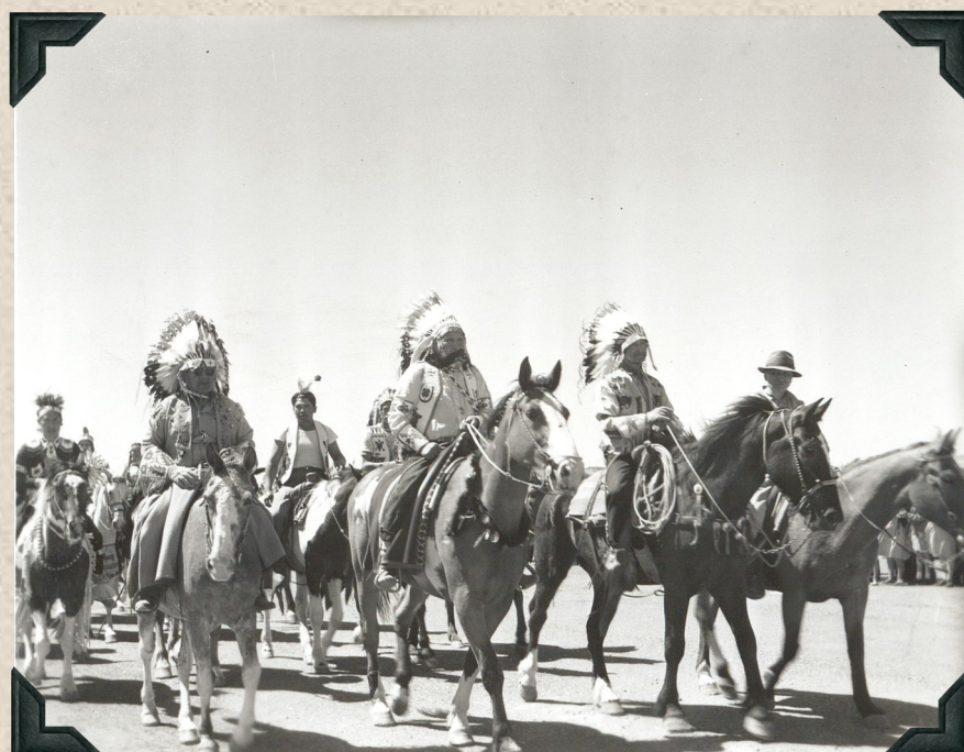
Warm Springs Tribal Members