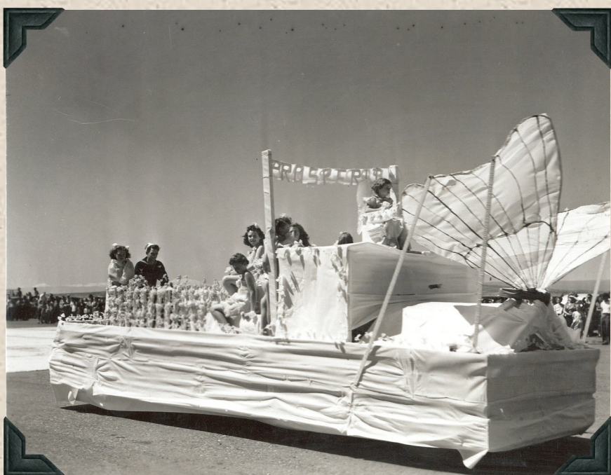
Water Festival Queen's Court Float