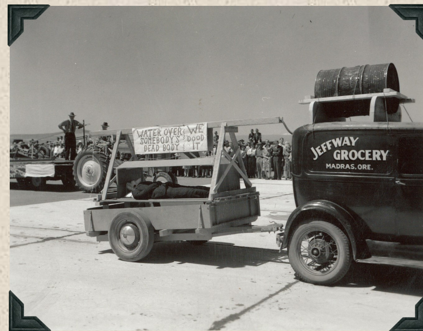
Jeffway Grocery, Madras, OR "Water Over Somebody's Dead Body—We Dood It."