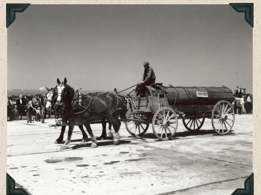
Horse drawn wooden water tank