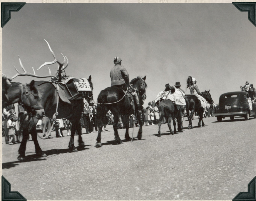
Water Festival Parade Participants