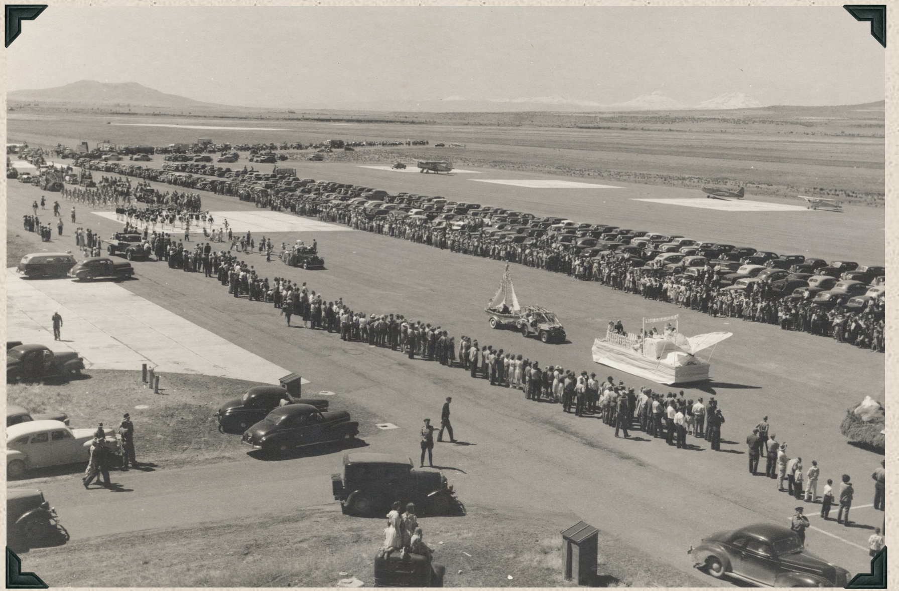
May 18, 1946 - Part of estimated 8,000 people gathered on the Madras Air Base to herald the coming of irrigation water to the North Unit lands.