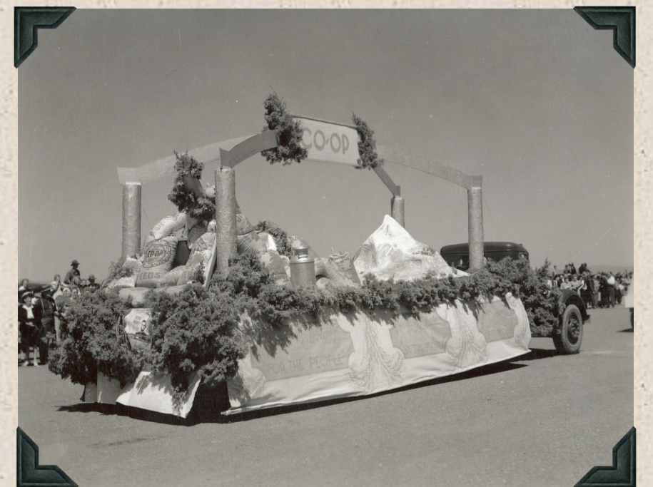
Jefferson County Co-Op Float