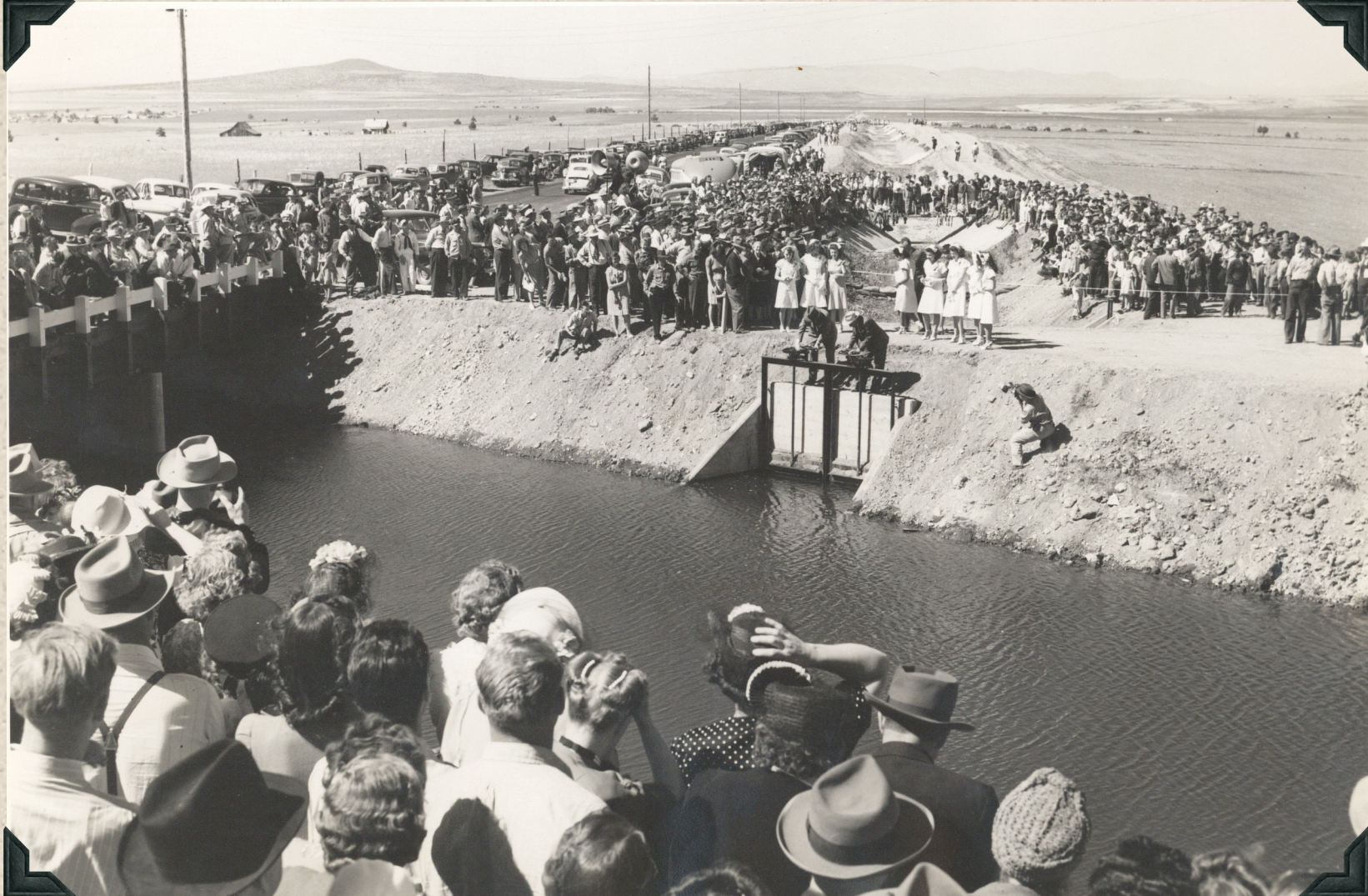
May 18, 1946 - After the parade, people traveled in a large caravan of vehicles from the air base to the main lateral canal where they gathered for the pinnacle of the celebration, the release of the first irrigation water into Lateral M-41. The headgates were opened by US Bureau of Reclamation personnel. Water flowed down the lateral to the farm of George Rodman, where it was turned onto his land to illustrate irrigation procedures. Plans call for delivery of water to about 20,000 acres in 1946.