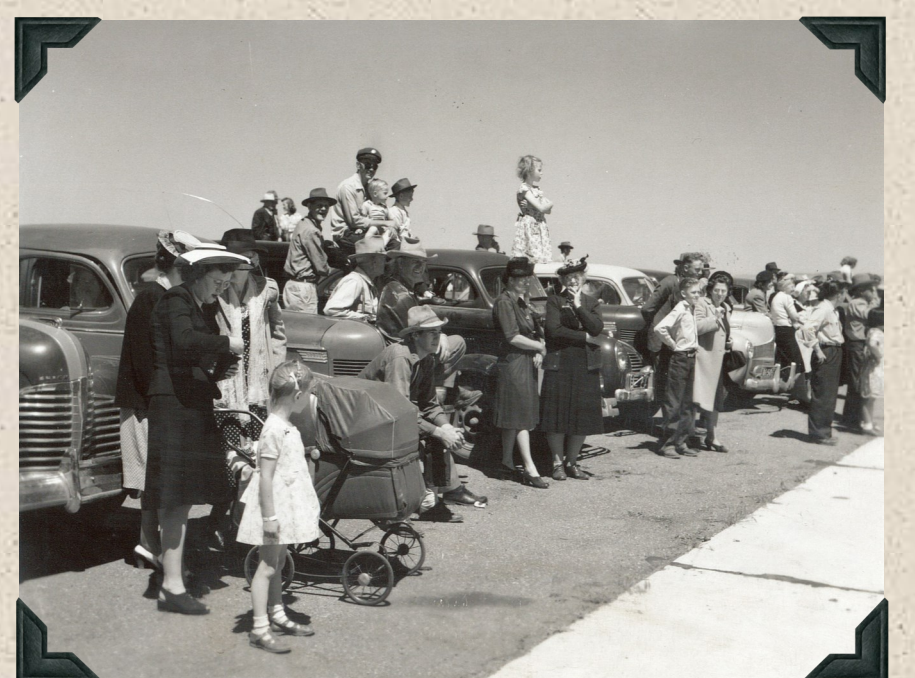
Water Festival Parade Attendees