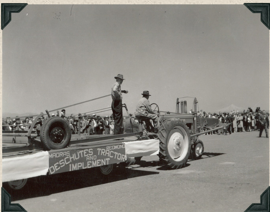
Deschutes Tractor & Implement Float