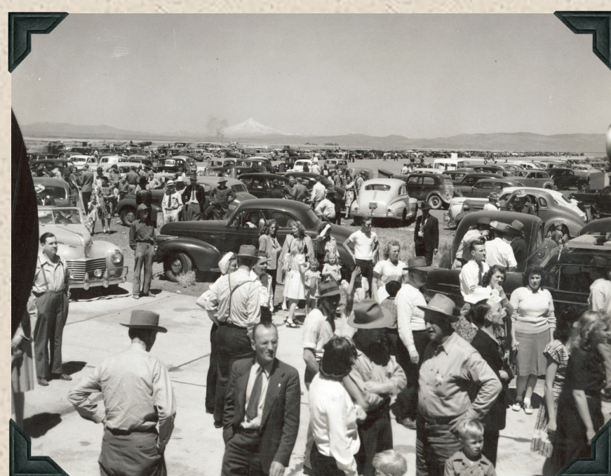
Water Festival Parade Attendees