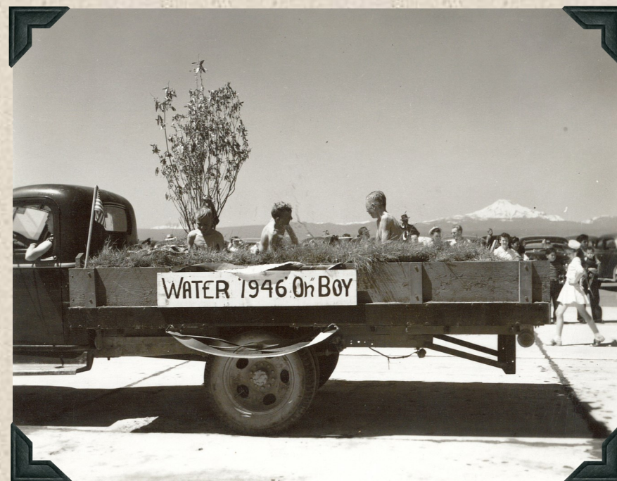
Parade Participant - Water "1946" Oh Boy