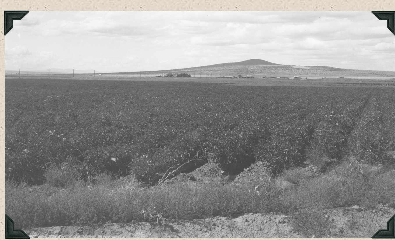
1947 - Looking west across a field of Netted Gem potatoes on Harold Tomkins farm near Culver, Oregon.