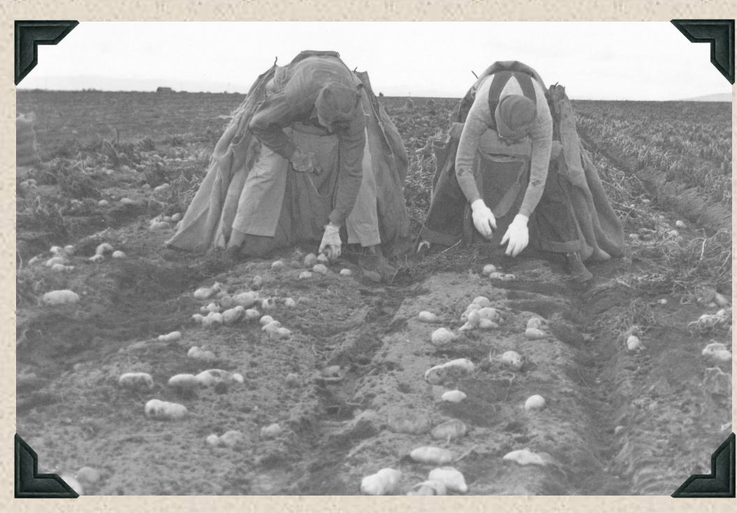
1946 - Potato pickers harvest first season's crop on the O. E. Bebb farm.