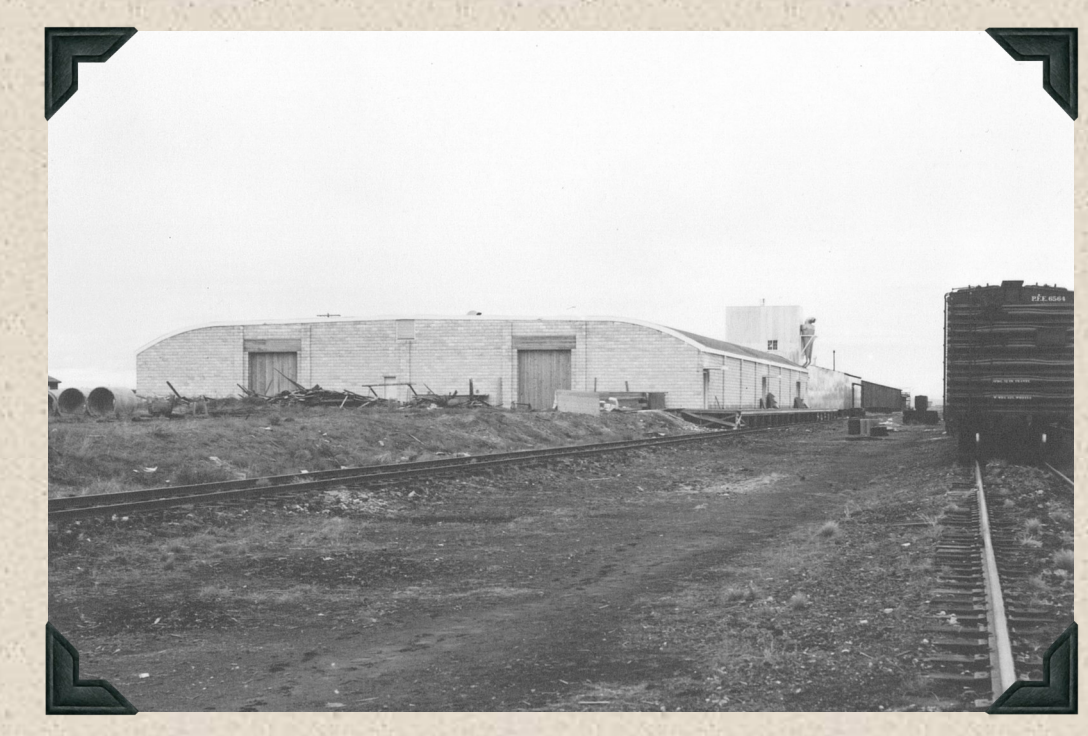
1947 - Two new warehouses in Culver, OR, taxed to capacity with first year's crop. More and larger facilities will be needed as the irrigated acreage increases.