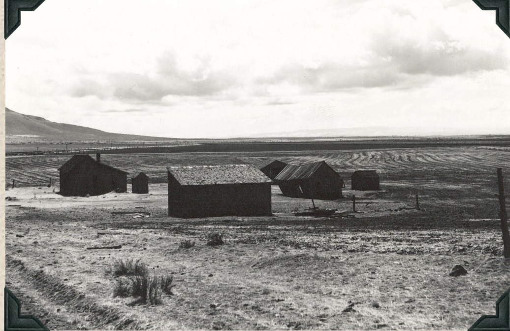
1945 - Reminiscent of the old days when Jefferson County depended upon one crop "wheat" and upon the weather never to favorable, is this deserted farm. A total crop failure in 1934 preceded by several years of poor returns caused many farm families to move out of the area. This deserted farm is near Culver, OR close to US Highway 97.