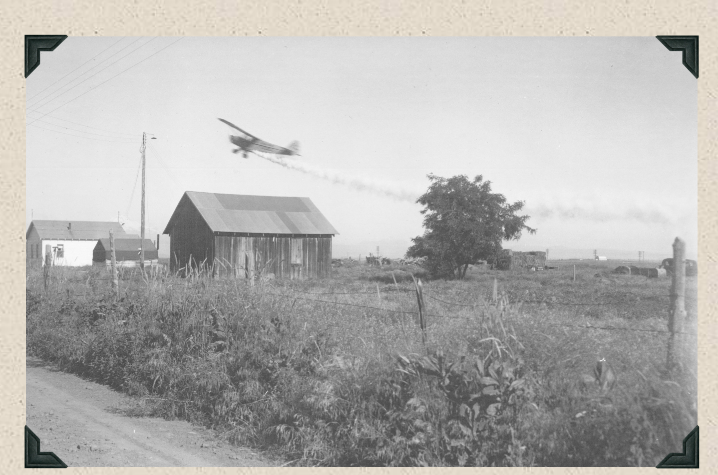
1948 - Airplane dusting clover seed crop on the North Unit near Culver, Oregon.