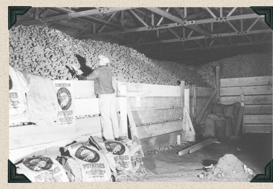
1947 - Deschutes Potato & Seed Co. Warehouse, Culver, OR. Checking a few of the 4,000 tons of potatoes stored, mostly certified seed for next year's planting.