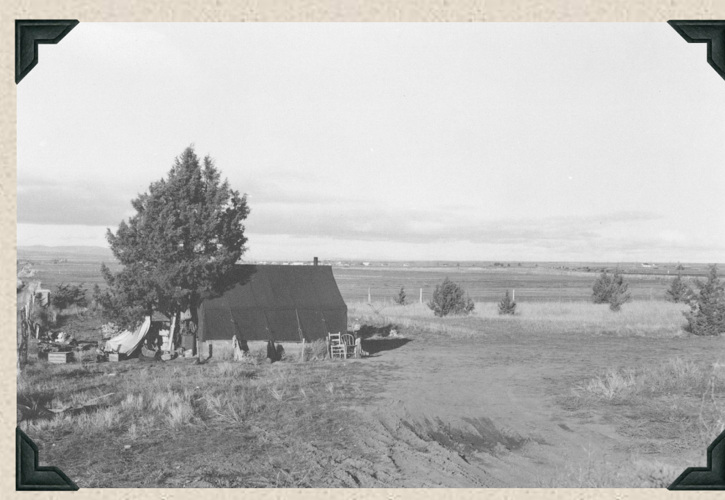
1947 - One of a few tent houses on the project. Most settlers were financially able to build new houses, buy machinery, etc.