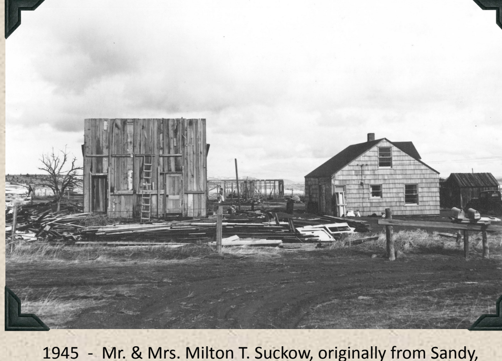
OR, bought 160 acres approximately 1 1/2 miles west of Metolius on lateral M-43. Technical assistance from the Bureau land use specialists and the local County Agent will help the farmers with their irrigation systems. At left is the old farm house, now being torn down to furnish lumber for the barn, the frame work for which can be seen in the center.