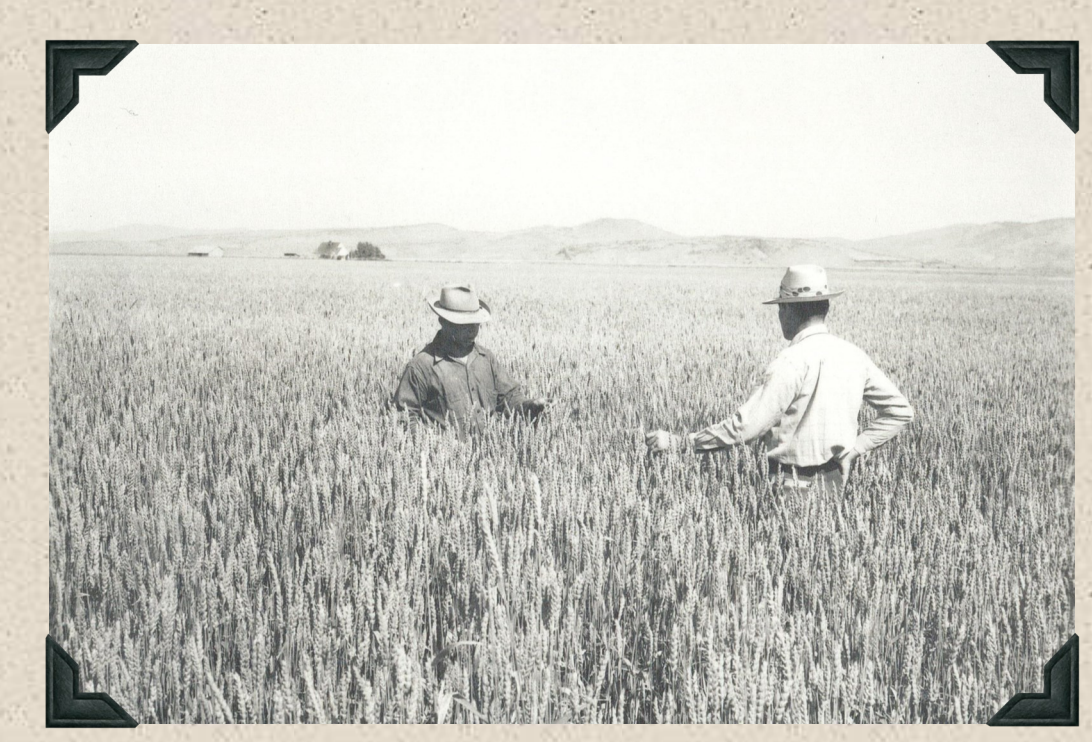
1949 - Irrigated field of Federation wheat. Adjacent dry farmed fields suffered from lack of water.