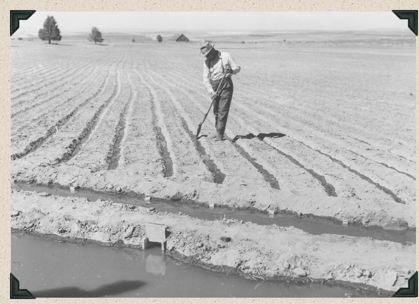
1946 - First water to reach land on the 50,000 acre North Unit. George Rodman farm. Lateral M-41.