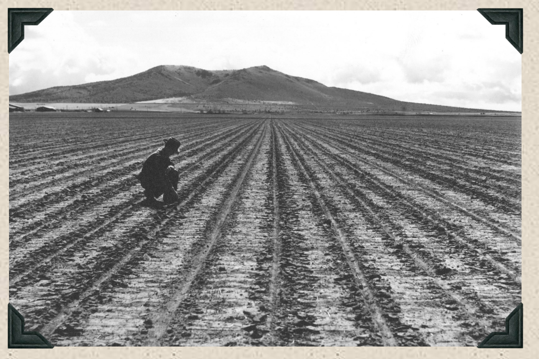
1946 - The "Doc" Harris place just west of Culver is ready for the coming of water this spring. This piece of land has been marked for ditches. Juniper Butte In the background.