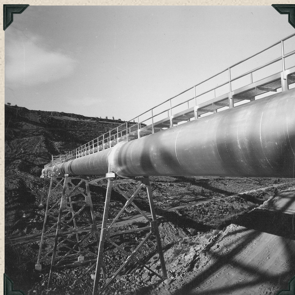
Completed Willow Creek Siphon.