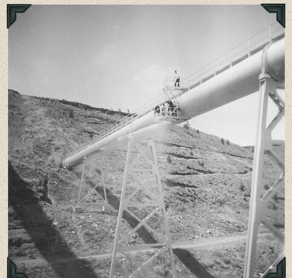
Willow Creek Siphon - Maintenance.