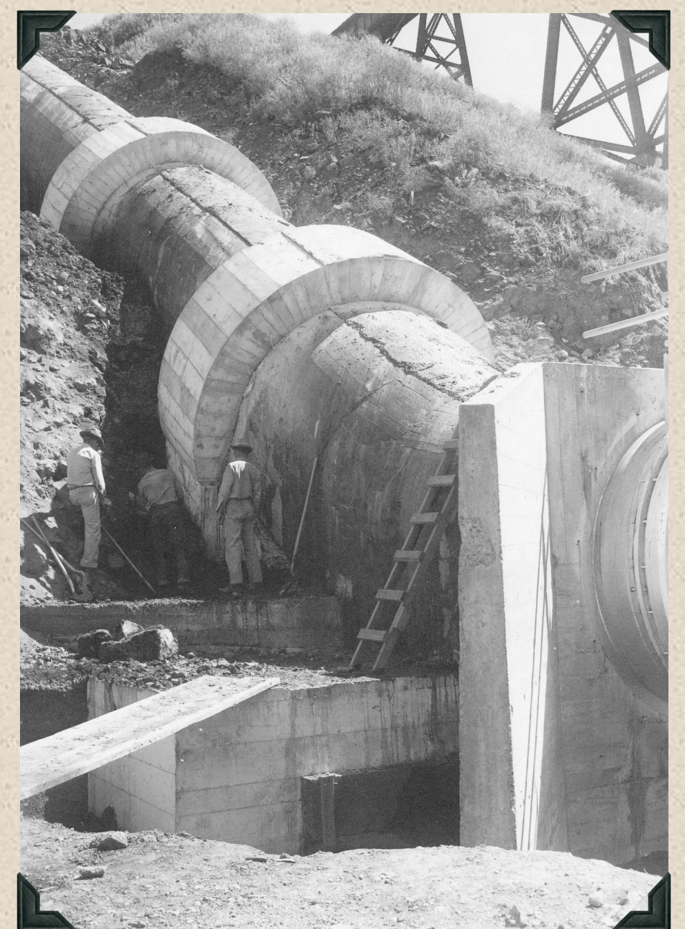
1948 - North Unit Main Canal. Willow Creek Crossing. Left side of concrete barrel with two collars and base block in place. Workmen installing drain tile.