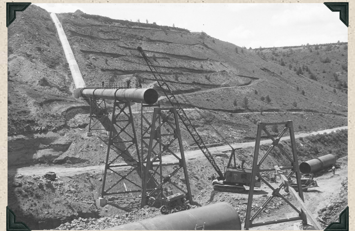
1948 - North Unit Main Canal. Willow Creek Crossing. View from north bank of canyon. Spot welding center pipe section in place.