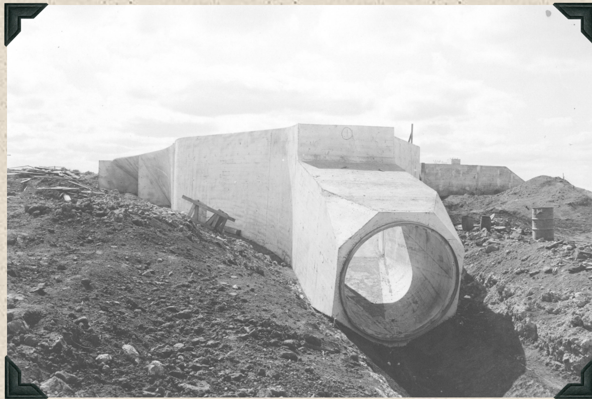
1947 - North Unit Main Canal. Willow Creek Siphon. Transition end of intake structure.