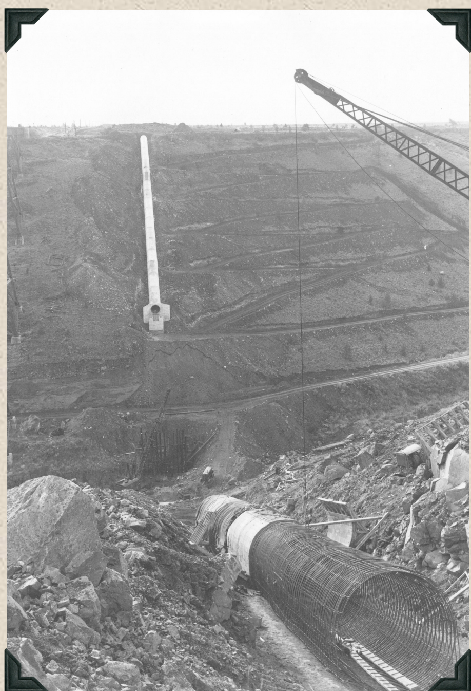
1947 - North Unit Main Canal. Willow Creek Siphon. Looking south, showing completed concrete barrel on south slope and partly completed barrel on north slope. Morrison-Knudsen Co.