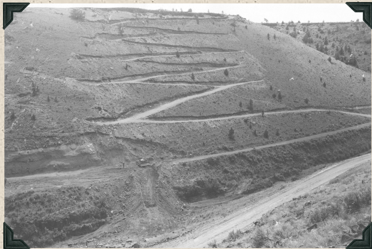
1947 - North Unit Main Canal. Willow Creek Crossing. Access roads on south slope.